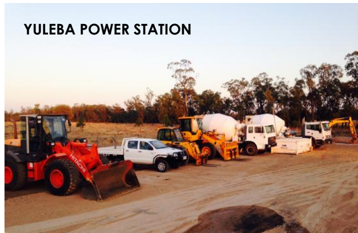
YULEBA POWER STATION

NEW Fixed Twin Silo Batch Plant in Dalby Qld 2013 CMQ Mobile Concrete Batching Plant 3 x 6.5M3 Concrete Agitators 2006 ACCO INTERNATIONAL 1 x 7.5M3 Concrete Agitator 2005 ACCO INTERNATIONAL 1 x 2013 Wirtgen SP25 Slipform Paver 1 x 2009 Hitachi ZW140 Wheel Loaders 1 x 2014 Victory Wheel Loader 2 x Transtar Prime Movers & Side Tippers 1 x 2009 Moore Step deck Float 1 x Freighter 22,000Ltr Water Tanker 1 x 2009 Stoodley End Tipper 2 x Freighter flat tops 1 x 2008 JCB Telehandler 2 x 2009 Case 420 Skidsteer Loaders 1 x 2012 FRR500 Isuzu Body Tipper 1 x 2009 UD MKA265 10.4T Flat deck Truck 1 x 2016 N SERIES Isuzu Service Truck 1 x Caldwell 100 Auger rig 1 x 2010 6T Hyundai Excavator 2 x Site Offices 2 x 2017 Hilux 4x4 Dual Cabs 2 x 2013 Hilux 4x4 Dual Cabs 1 x 2012 Hilux 4x4 Dual Cab 1 x 2011 Hilux Dual Cab 1 x 2010 Hilux Dual Cab Tool Trailers x 5